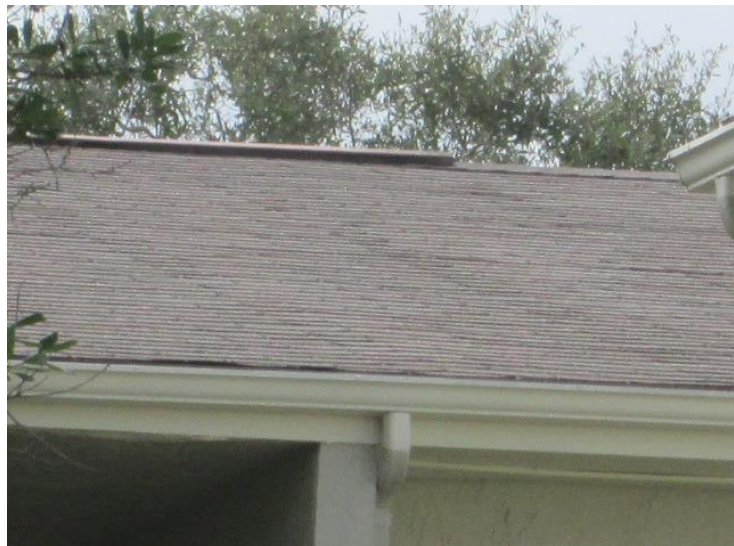
Roof Deck Material (Section 3)