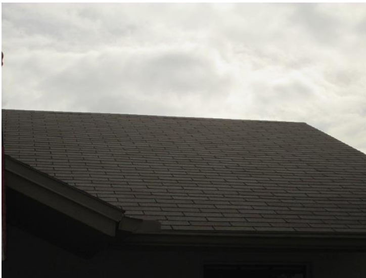
Roof Covering (Section 2)