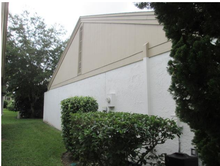
Roof Shape (Section 5)