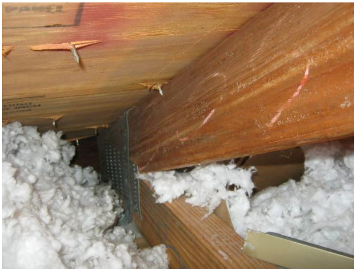
Roof to Wall Attachment (Section 4)