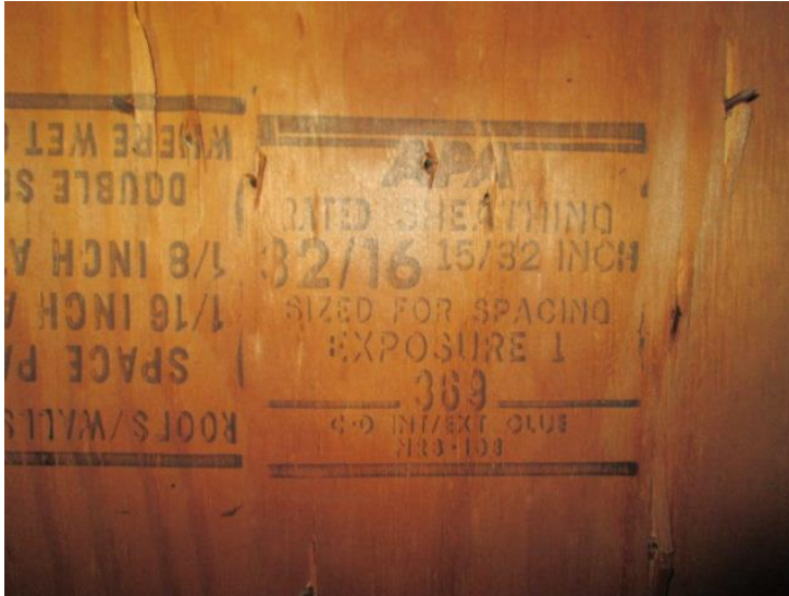
Roof Deck Material (Section 3)