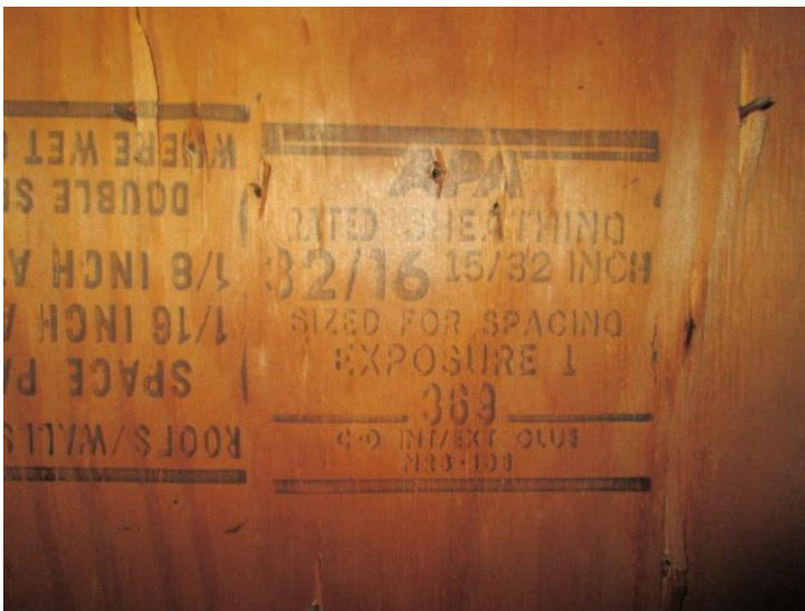
Roof Deck Material (Section 3)