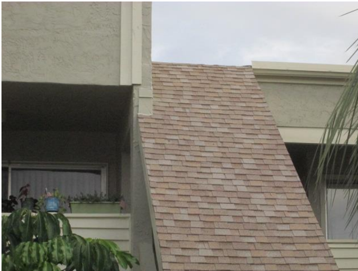
Roof Covering (Section 2)