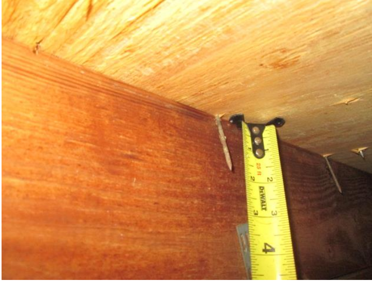
Roof Deck Attachment (Section 3)