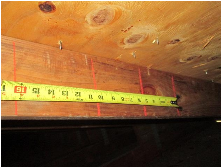
Nailing Pattern (Section 3)