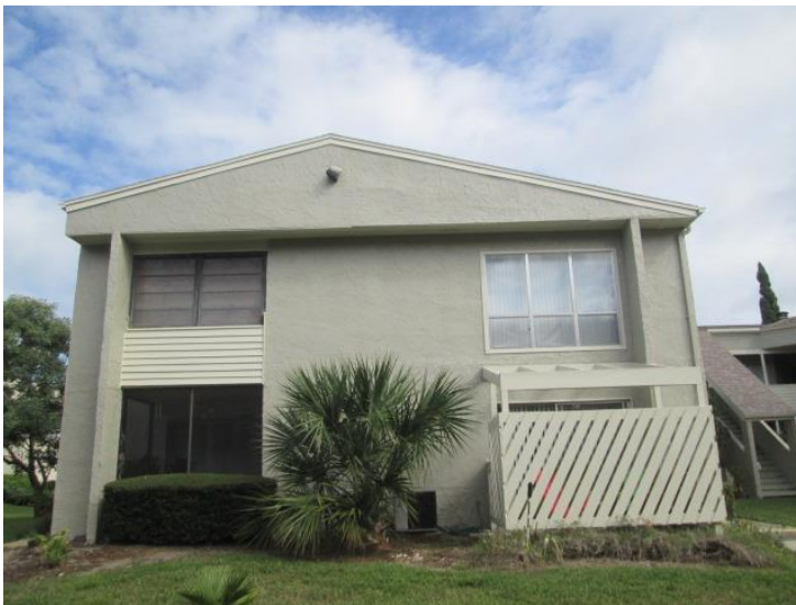
Roof Shape (Section 5)