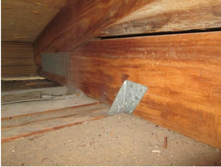
Roof to Wall Attachment (Section 4)