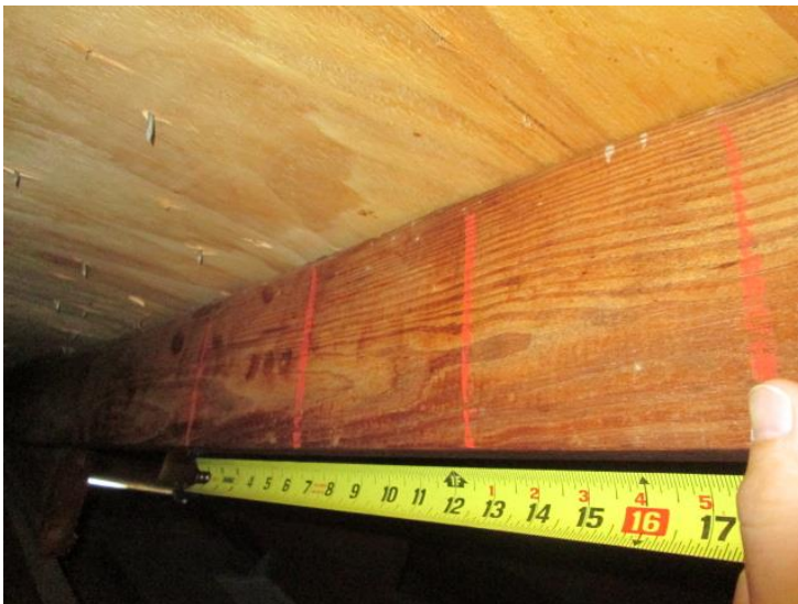
Nailing Pattern (Section 3)