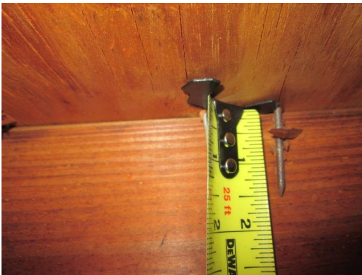
Roof Deck Attachment (Section 3)