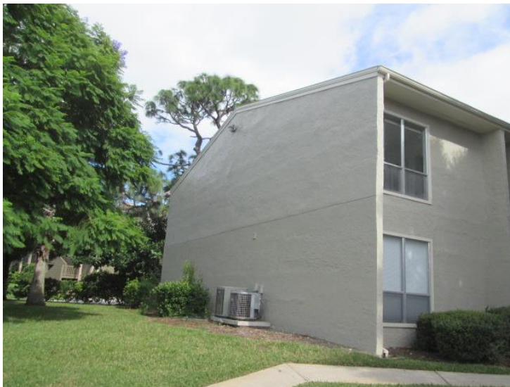
Roof Shape (Section 5)