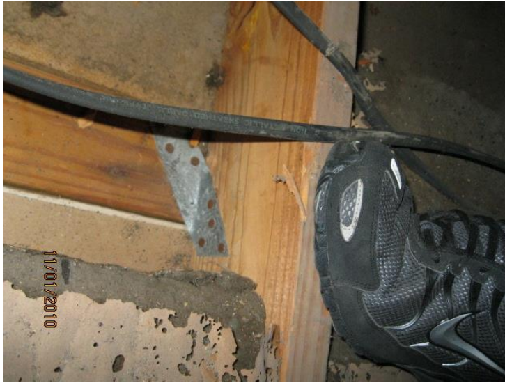
Roof to Wall Attachment (Section 4)