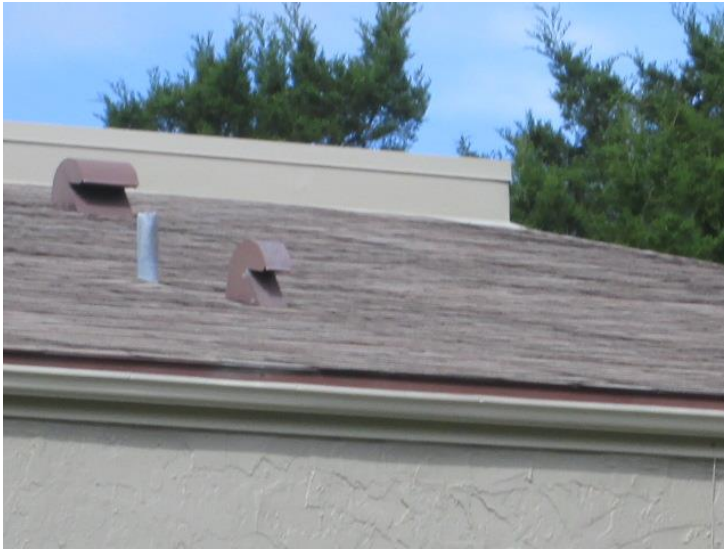
Roof Covering (Section 2)