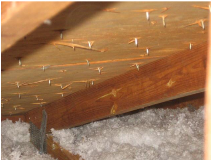
Roof to Wall Attachment (Section 4)