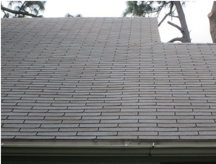
Roof Covering (Section 2)