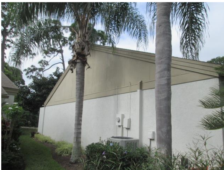
Roof Shape (Section 5)