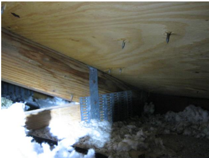
Roof to Wall Attachment (Section 4)