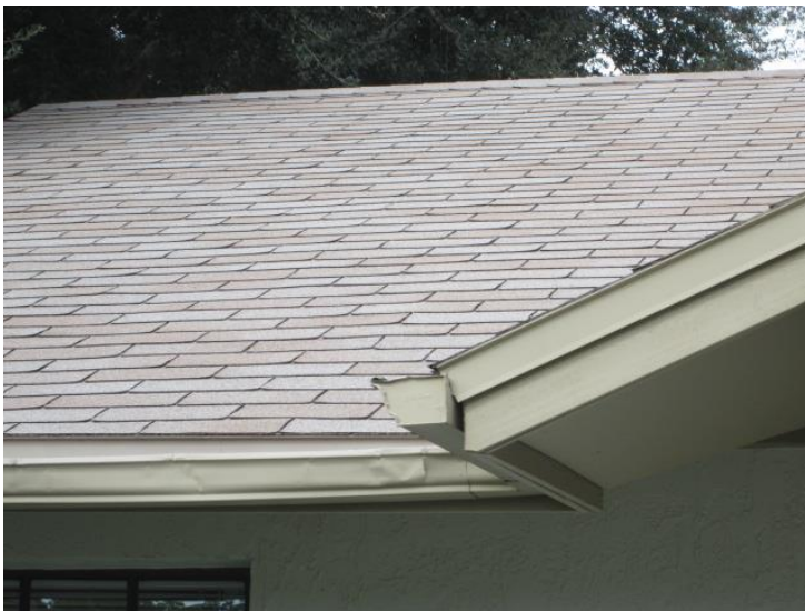
Roof Covering (Section 2)