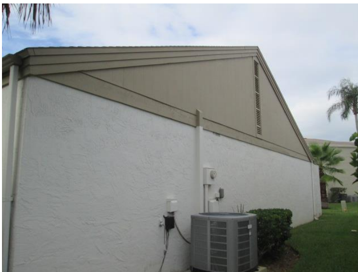
Roof Shape (Section 5)