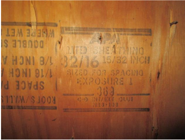
Roof Deck Material (Section 3)